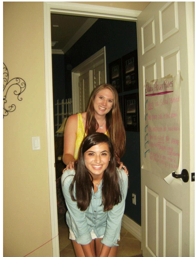
*Pictured above are “family” pictures. The one at the bottom is a little and the one above them is their big.